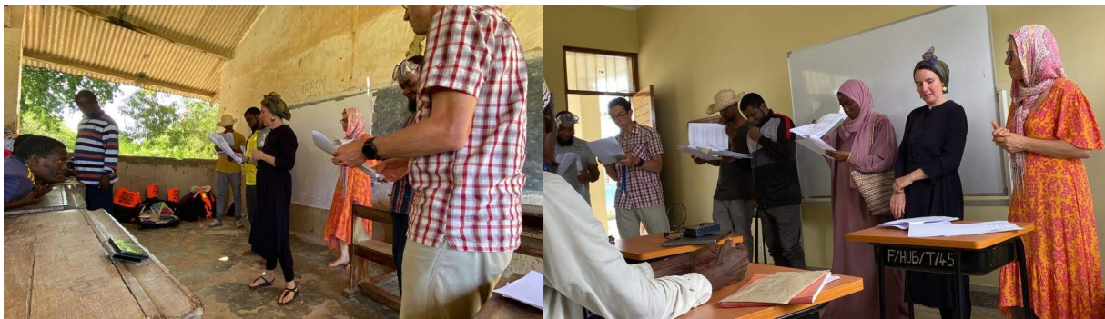
Play-reading during the OctoPINTS feedback sessions in Zanzibar in June 2022.

This play script provides the setting of a scene which includes dialogues and actions of different characters in a small-scale fishery context. It represents a fictional performance of what some fishery actors say and feel about periodic octopus closures in Zanzibar, Tanzania. The script was originally created for the feedback sessions within the OctoPINTS project in June 2022, and now, it is available online so that everyone is welcome to read or even adapt it for their own purposes.